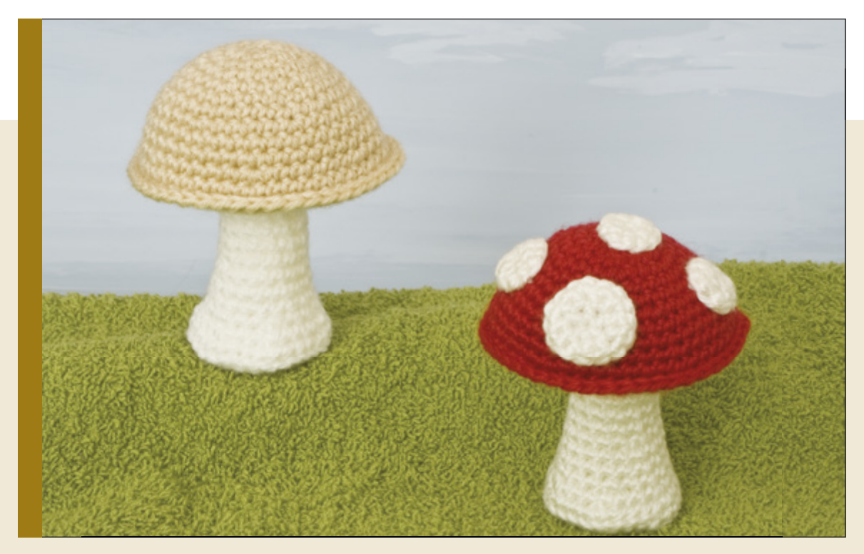
Adorable mushrooms and toadstools are all the rage in the crafty world, and you can create your own ami versions with some simple shaping techniques. Crocheting the top to the base of the mushroom makes a nice corner around the edge of the mushroom cap, and the underside edge stitches (below) remind me of the gills under the cap of a real mushroom! Turn to the Patterns section to make your own.