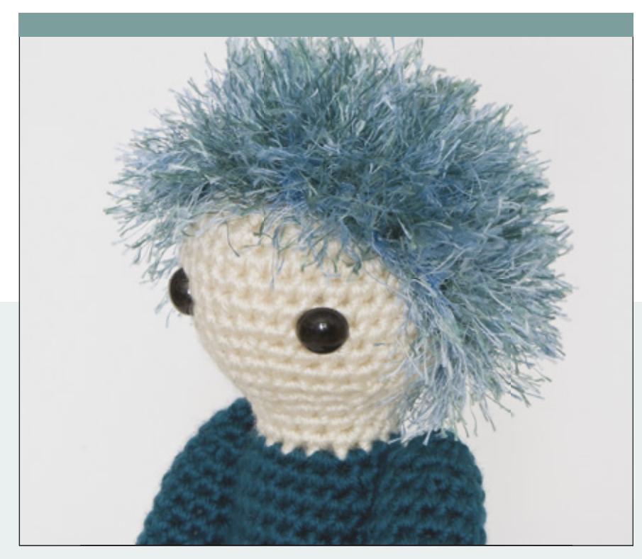
Adding hair to your amigurumi is often an intimidating thought—but it needn't be! You have several options when it comes to giving your ami boy and girl hair. Shown here are only two ideas: an eyelash yarn wig (top) and a latch hook-style wig (bottom). Find instructions for both hairstyles in the Patterns section.