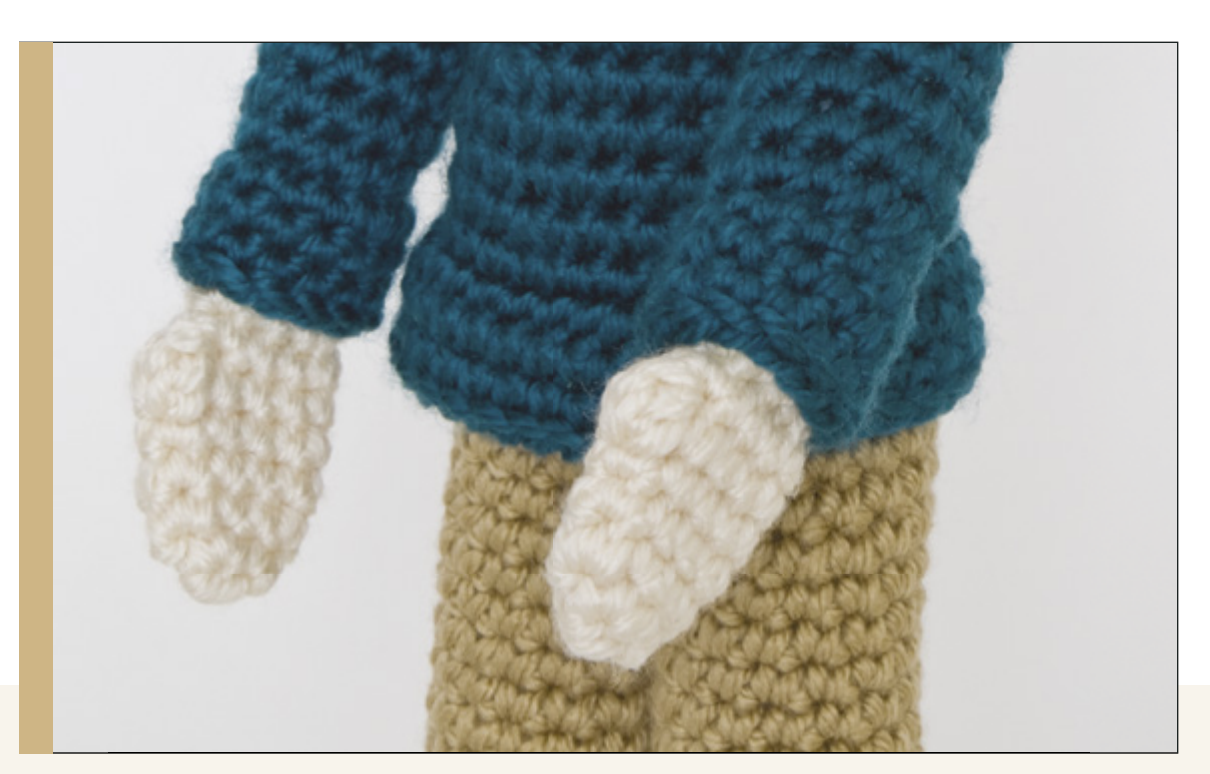
Sometimes the smallest details make a piece just right! Extending the bottom of the shirt and the sleeves over the top of the pants and the wrists (top) creates the illusion that the shirt sits on top of the body instead of being crocheted all in one. Adding separate cuffs to the pant legs (bottom) makes them overlap the shoes. (If you peek up the bottom of a pant leg, you can see the tops of the shoes and the ankles!) Learn more in the Patterns section.