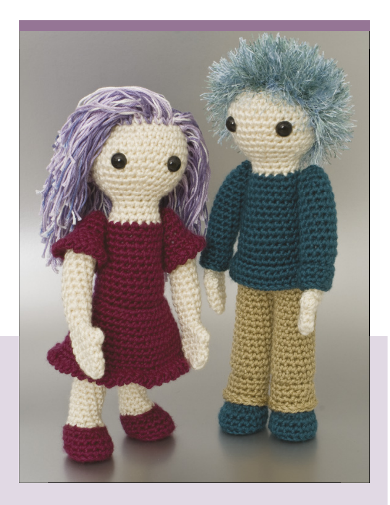
Amigurumi animals are super cute, but check out this boy and girl ami! I've made the patterns very simple to follow and, more importantly, easy to customize! If you're feeling really creative, crochet these two as you and your special someone. Both patterns are waiting for you in the Patterns section.